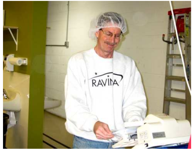
Feed My Starving Children Saturday, November 5, 2011