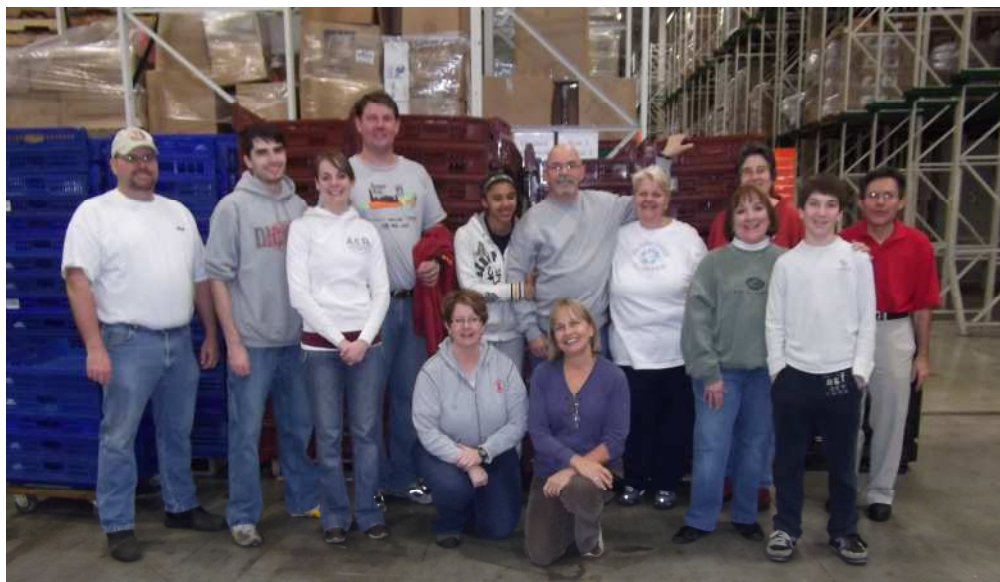
A mission team from our church helped package over 5000# of bread last month when it visited the Greater Chicago Food Depository.