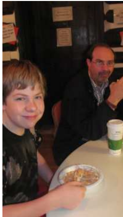
Our Confirmands on Retreat with those from Hinsdale UMC