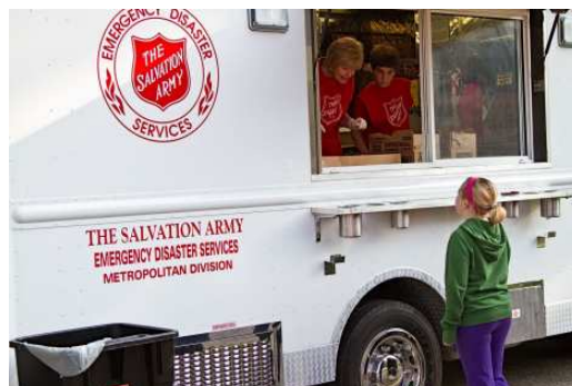
Salvation Army Food Truck