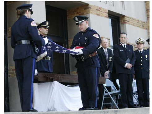
I-BEAM from Twin Towers