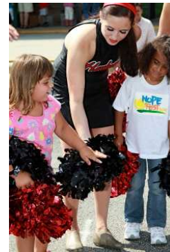
MSHS Hawkettes teach dance routine