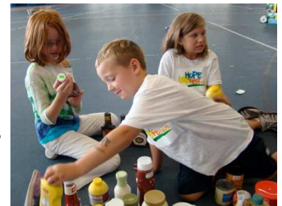
Sorting Food Pantry Supplies