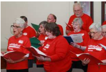
Singing at Bethany Terrace