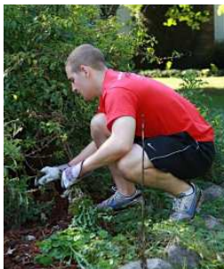
Yardwork at Youth Campus